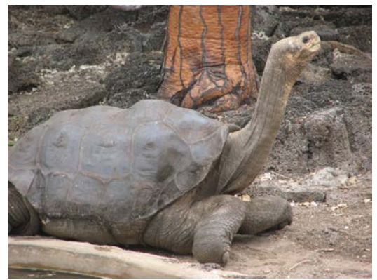
Lonesome George

Nevertheless, humans thrived – at least their number, with 7.063 billion individuals at the end of 2012. In April the Royal Society forewarned in a significant report that world population needs to be steadied quickly and high consumption in rich countries rapidly reduced to avoid a downward spiral of economic and environmental harms.